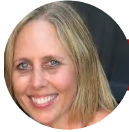
NARELLE GREEN GROUP