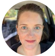
FIONA FEE COLLECTION