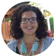
LINDA 4YO ENROLMENTS