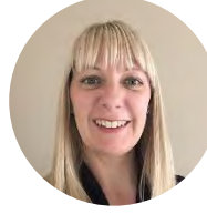
KELLIE 3YO ENROLMENTS