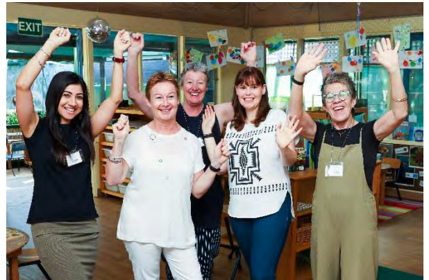
BWK's dedicated and enthusiastic teachers!