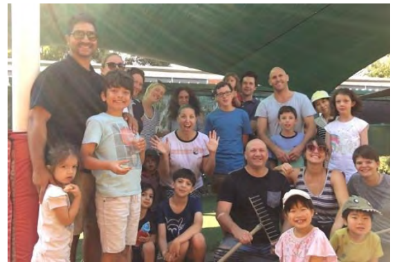
Our wonderful Working Bee volunteers!